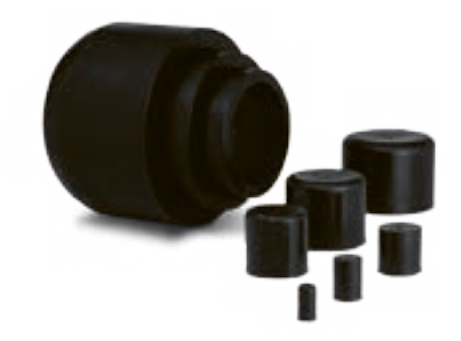
For example, end caps extend from d20 to d1000 mm \,

The well-known and well-proven spigot fitting is, technically up-to-date. Decades of injection moulding experience in combination with the latest processing technology place our products at the peak of quality. The exclusive use of high-grade PE 100 material assures efficient utilisation even under demanding conditions.