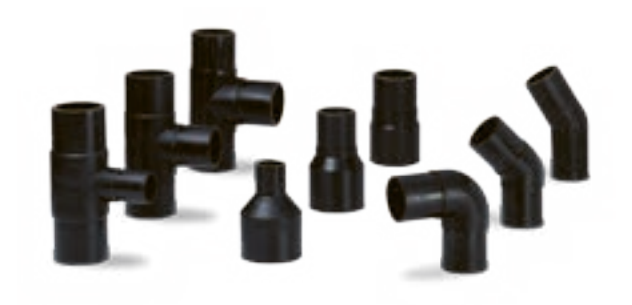
Wide range with respect to diameter and outlet

The extensive spigot fitting range from GF is the natural complement to the ELGEF Plus electrofusion program. Elbows, tees, bends, reducers, end caps and flange adapters in the sizes from d20 to d1000 mm are all available. These spigot fittings can be easily combined with ELGEF Plus electrofusion couplers or fittings, illustrating their pronounced diversity. This variety and wide range are especially interesting for those important applications. Additionally, reducers and reduced outlets can prove indispensable under difficult conditions.