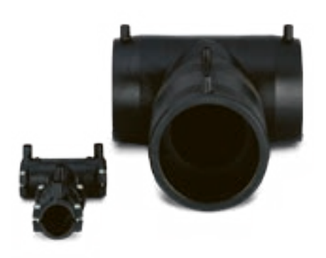
Supplied in kit form, on request: the third electrofusion outlet