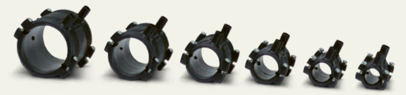
Electrofusion couplers with integrated pipe fixation for sizes up to d63 \,\mathrm{mm}

Electrofusion couplers for large diameter pipes with active